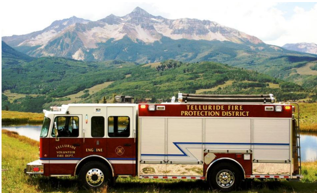
Telluride Fire Protection District Rosenbauer/General Safety Rear Mount Pumper

Kenworth T-300 chassis, Cummins ISC 330 engine, Darley 750 GPM PTO pump, 3000 gallon water tank, pre-piped deck gun, 10" rear dump valve, 3500 gallon folding tank storage, Weldon 12 volt scene lighting.