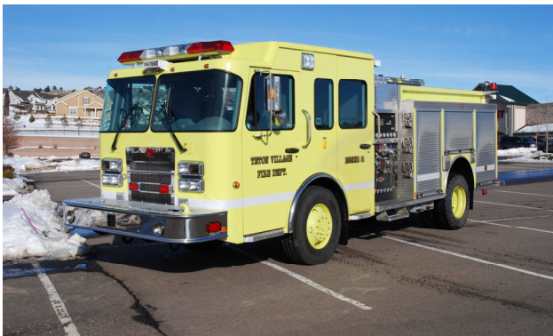
Teton Village Fire District Rosenbauer/Central States Pumper

Spartan Advantage low-profile 4x4 chassis, Cummins ISL 400 engine, Waterous 1500 GPM pump, 750 gallon water tank / 30 gallon foam cell, Foam Pro 2001, Akron Sabermaster electric deck gun, Onan 10kw hydraulic generator, Super Vac 3900 watt light tower, electric cord reel, Code 3 LED warning lights, Rosenbauer's exclusive Safe Steps.