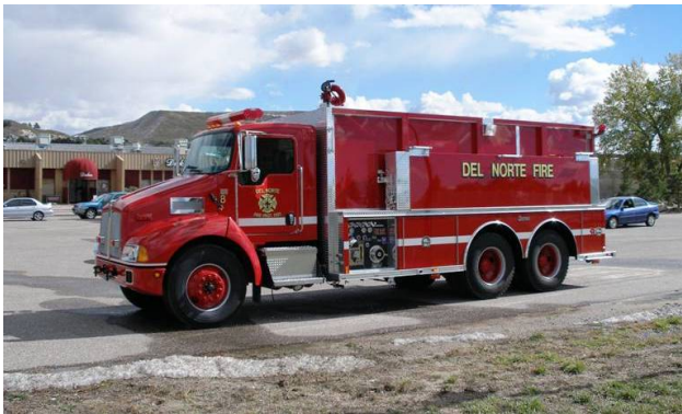
Del Norte Fire Protection District Rosenbauer/Central States 3000 Gallon Tender

Spartan Advantage low-profile 4x4 chassis, Cummins ISL 400 engine, Rosenbauer NH 1250 GPM pump with pump & roll capability, 750 gallon water tank / 30 gallon foam cell, Rosenbauer Max CAFS and Fix Mix Foam system, Hart-A-Gen 6kw hydraulic generator, Super Vac 3000 watt light tower, Akron Fire Fox bumper turret, ground sweep nozzles, truck protection sprinkler system.