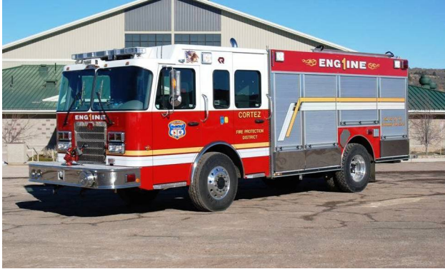
Cortez Fire Protection District Rosenbauer/General Safety Rear Mount Pumper

Spartan Advantage low-profile 4x4 chassis, Cummins ISL 400 engine, Rosenbauer NH 1250 GPM pump with pump & roll capability, 750 gallon water tank / 30 gallon foam cell, Rosenbauer Max CAFS and Fix Mix Foam system, Hart-A-Gen 6kw hydraulic generator, Super Vac 3000 watt light tower, Akron Fire Fox bumper turret, ground sweep nozzles, truck protection sprinkler system.